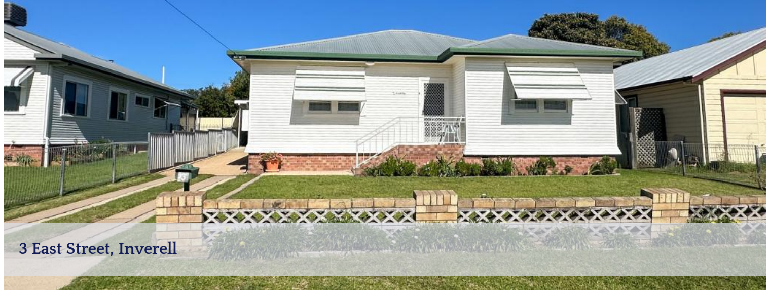
3 East Street, Inverell