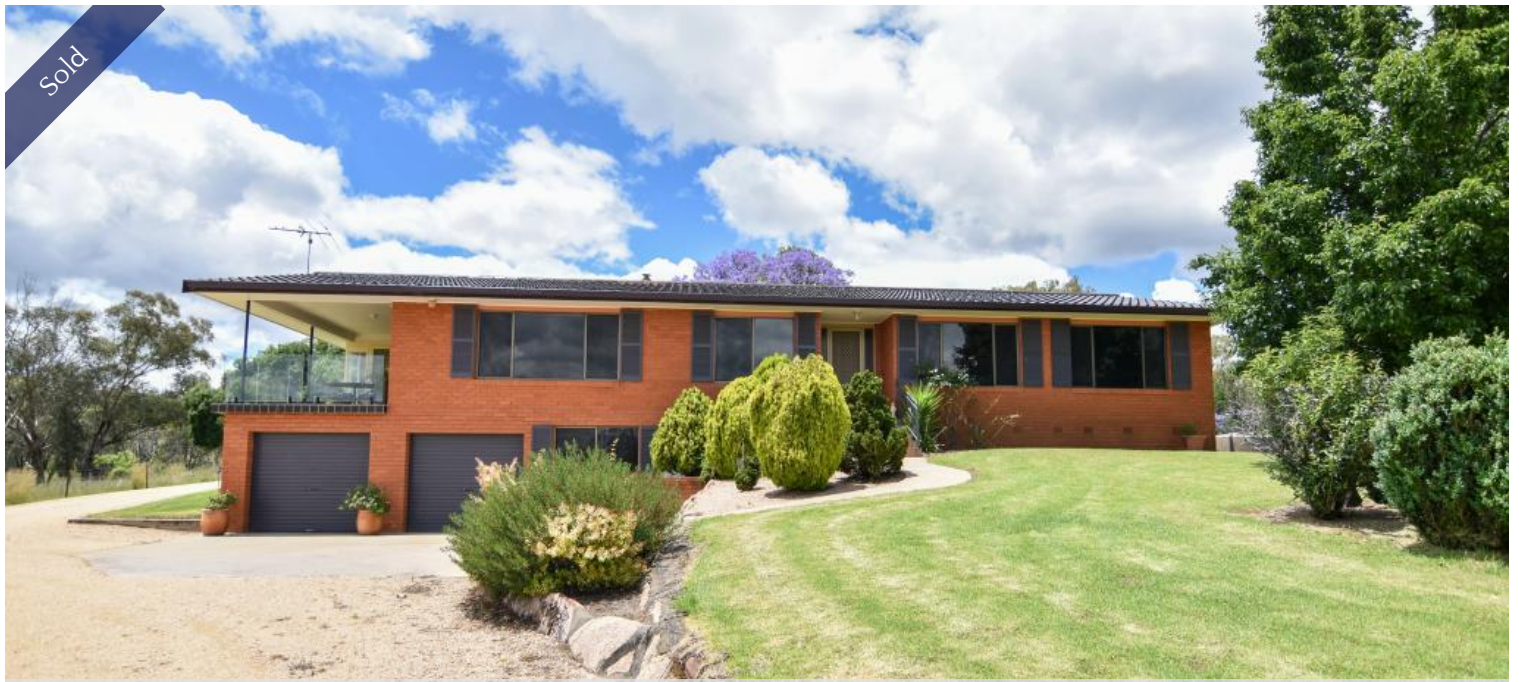
21 Cunninghams Lane, Inverell