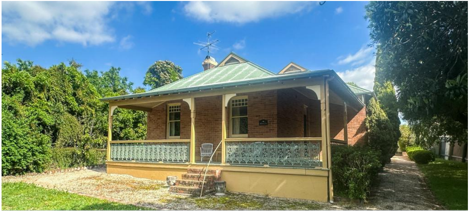
11 Mitchell Crescent, Inverell