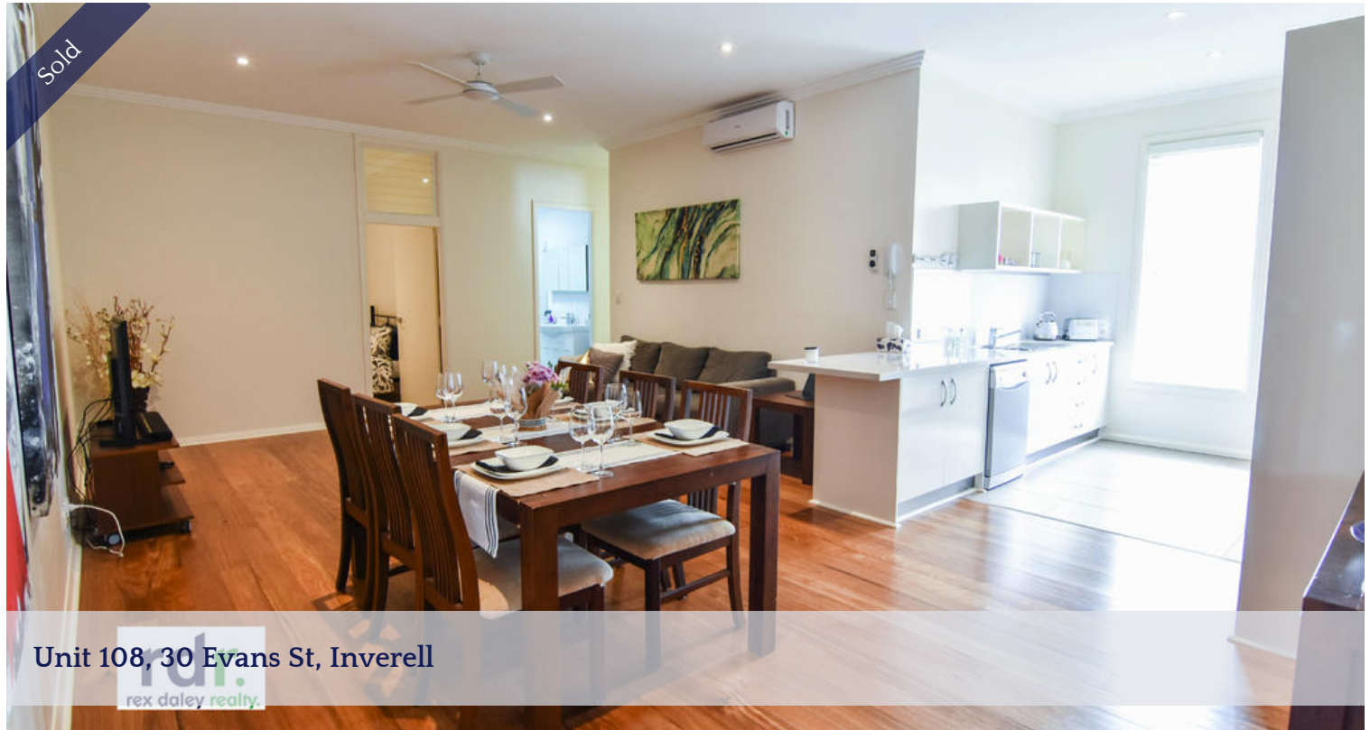
Unit 108, 30 Evans St, Inverell