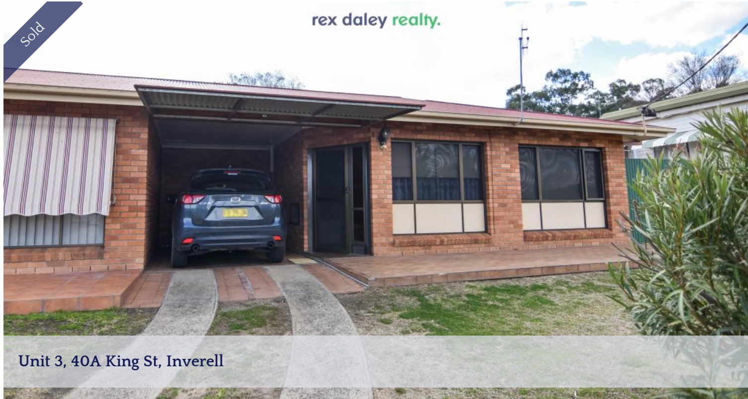
Unit 3, 40A King St, Inverell