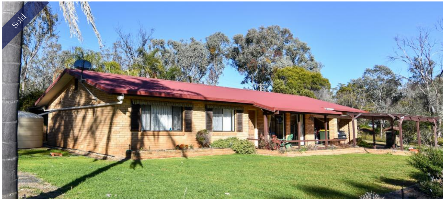
26 Cunninghams Lane, Inverell