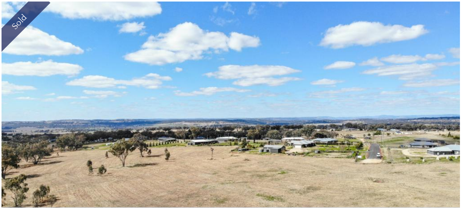
Lot 41 Daley Close, Inverell