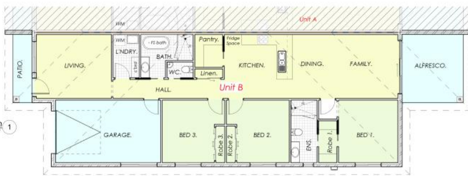
Floor Plan 1